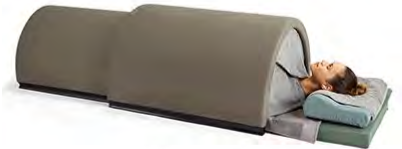
Bamboo Carbon curtain included. Towels sold separately.